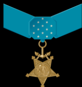
LTJG Clyde Lassen, USN Pilot